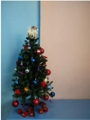
We decorate a Christmas tree

This is how WE, 5 th Grade Students, celebrate Christmas this year: