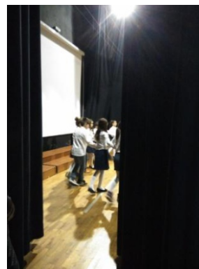
We participate in a school show