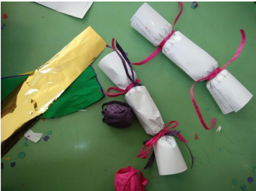
We make Christmas crackers