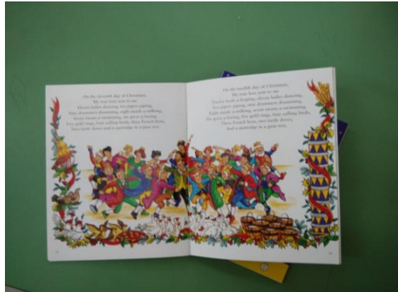
We read Christmas stories